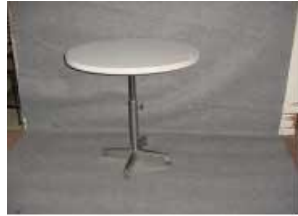
F - 02