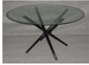
F - 03