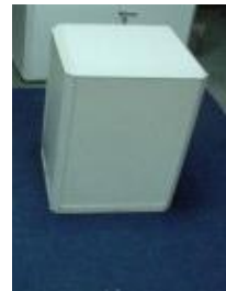
F - 09