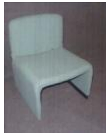
F - 06