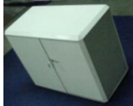
F - 12