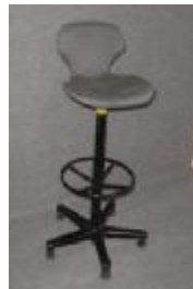
F - 07