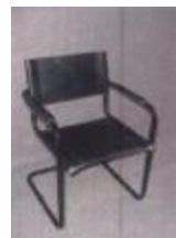
F - 04