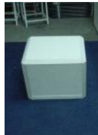
F - 08