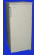
F - 15