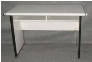
F - 01