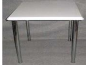
F - 14