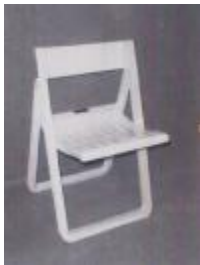
F - 05